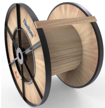
Iron wooden reel

Wooden reel: outer retaining recommended, inner retaining or groove retaining available.