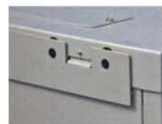
Installing back panel